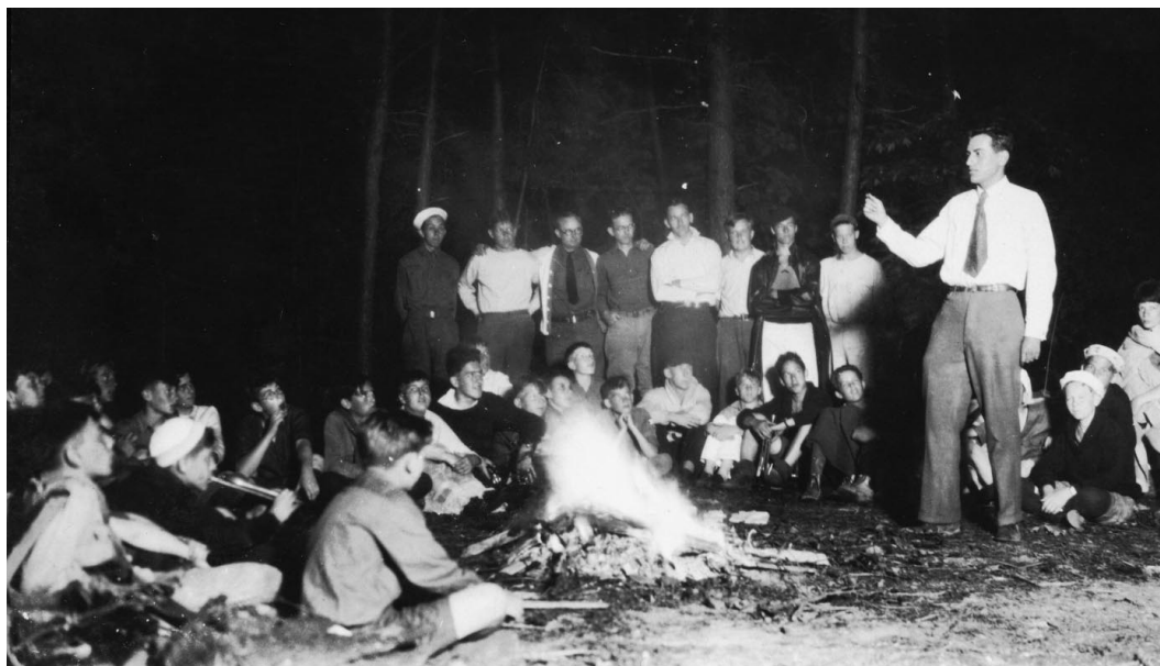
FIGURE 1. A fireside presentation by a young Alexander Skutch (1928).