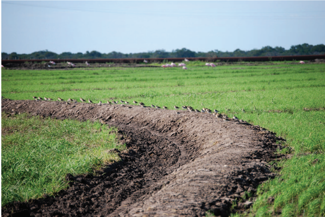
FIGURE 1. Shorebirds, mainly Pectoral Sandpipers ( Calidris melanotos ), resting on a levee in a rice field at Estancia La Lucha, Argentina, January 2010.

products can occur as late as the grain maturation phase depending on pest infestations.