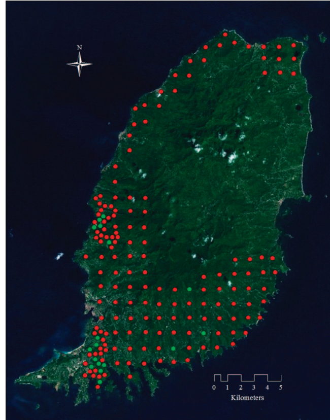
FIGURE 2. Map of the island of Grenada (area \sim 34,400 ha; 12.00^\circ\text{N} , 61.78^\circ\text{W} ), showing the survey region, which covered 7,621 ha. Green circles are for survey points where Grenada Doves were detected during July 19–31, 2013.

A 6-min count increased the chance of detecting calling doves visually, facilitating distance measurements with rangefinders. However, when calling doves were not seen, we measured distances to the nearest horizontal locations and used distance categories (0–15, 16–30, 31–45, 46–60, 61–90, 91–120, 121–180, 181–240, 241–340, and 341–440 m; Rivera-Milán et al. 2003b, 2014). Moving doves were not