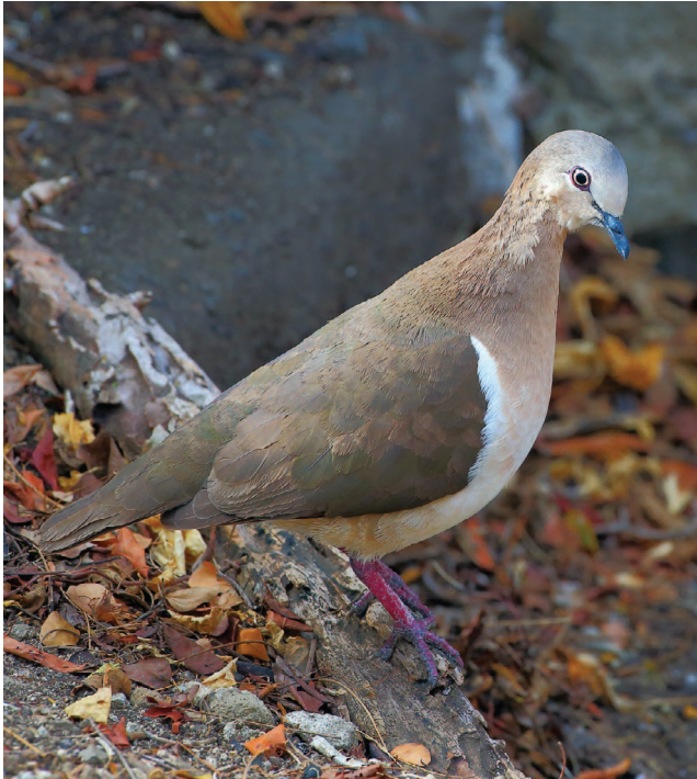
FIGURE 1. When a Grenada Dove is flushed from a perch by an approaching observer, it will fly a short distance to another perch or to the ground and walk slowly away to find cover. Grenada Doves can also be seen singly or in small clusters drinking water and foraging on the ground in forested areas.

and k is the number of survey points. We truncated the distance data ( w = 340 m) and estimated detection probability as