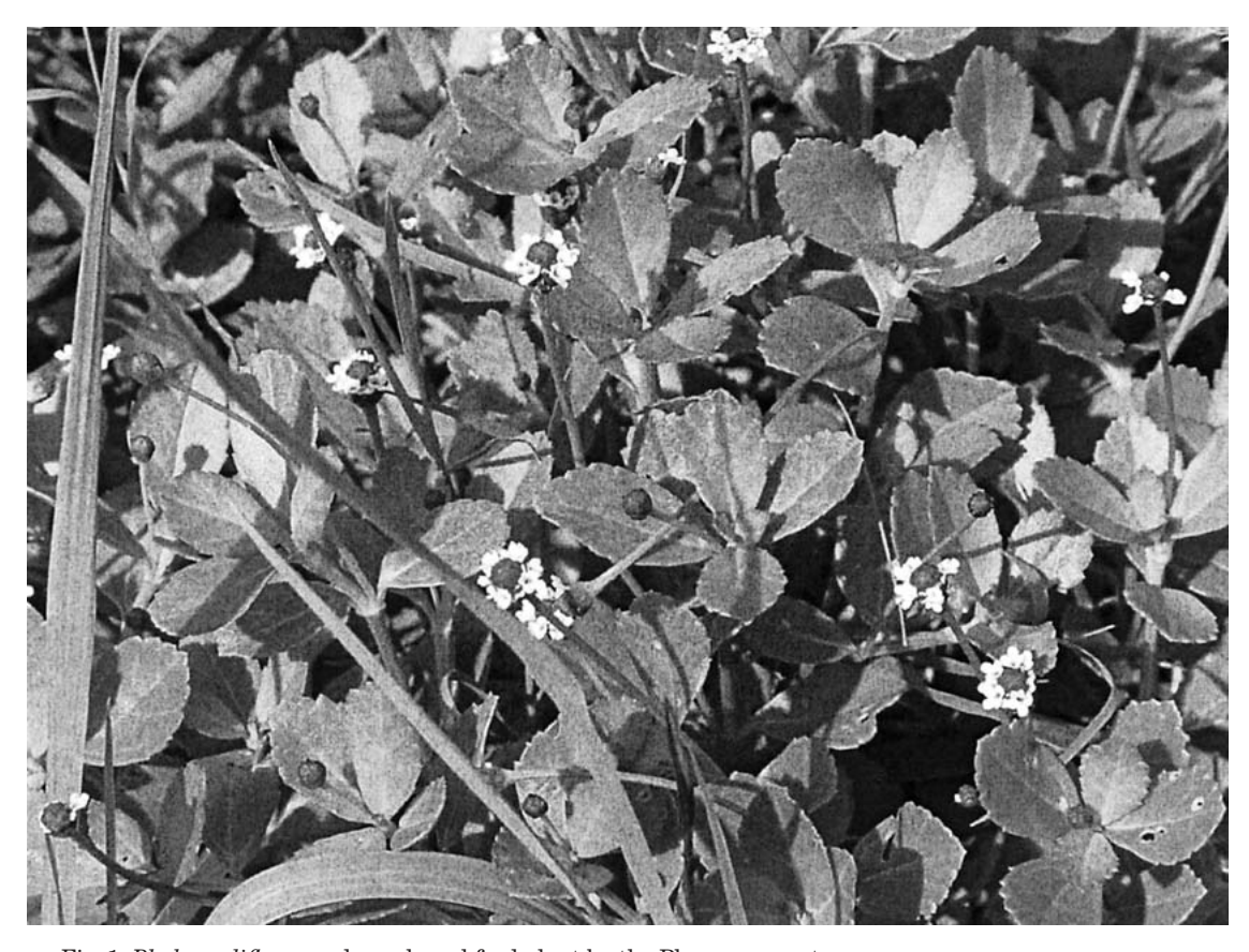
Fig. 1. Phyla nodiflora used as a larval food plant by the Phaon crescent.