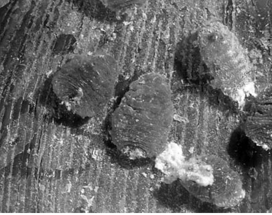
Fig. 2. Palmicultor lumpurensis adults on bamboo.

economic impact of these invasive species for Florida's bamboo is not yet known. Monitoring of populations from each of these invasive species