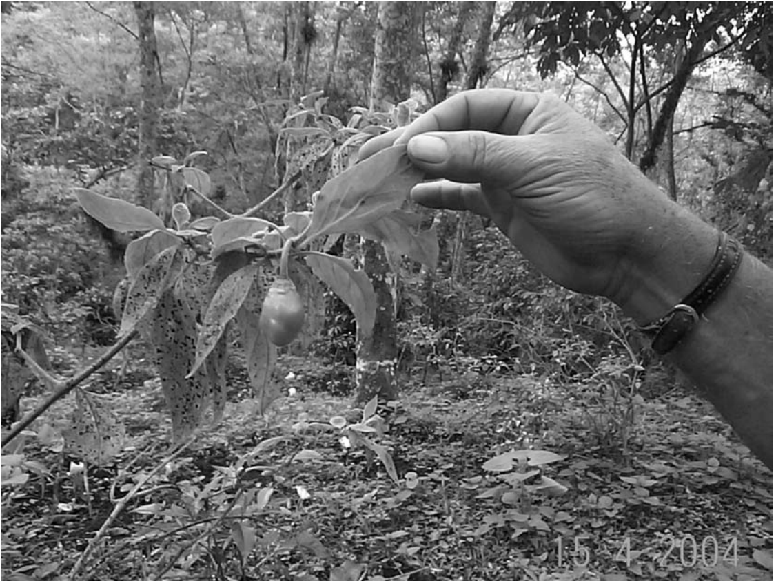
Fig. 2. Manzano pepper plant in a coffee finca at Ixhuatlan de Cafe, Veracruz where the infested peppers originated.

ecological, then manzano peppers may be more susceptible to infestations than other commercial pepper varieties. If so, this information is relevant to quarantine and import inspection protocols.