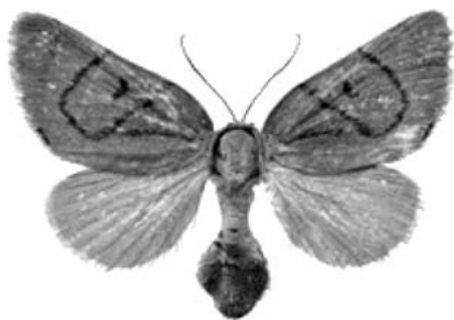
Fig. 1. Camptoloma kishidai sp. nov. : Female, holotype, upperside.

Forewing triangular, somewhat longer, costa slightly arched, termen nearly straight, dorsum slightly curved, apex pointed, tornus near rounded. Hindwing nearly rounded, costa straight. Forewing ground color yellow, with typical Camptoloma wing pattern. Antemedian, postmedian, discocellular, submarginal and marginal fasciae dark brown and well defined, the former two fasciae slant from costa to tornal red patch, gradually narrowed to their lower ends. Discocellular fascia fine, placed nearer to postmedian fascia than to antemedian fascia, with its lower part gradually shaded to the end of postmedian fascia. Submarginal fascia slightly curved inwardly, marginal fascia straight. The two longitudinal fasciae placed on the lower basal wing straight, well defined and nearly extending to the reddish patch; the two dark brown spots on lower termen much larger and well developed; the reddish patch in tornal area much smaller. Hindwing ground color yellow, without distinct marking. Cilia yellowish-white.