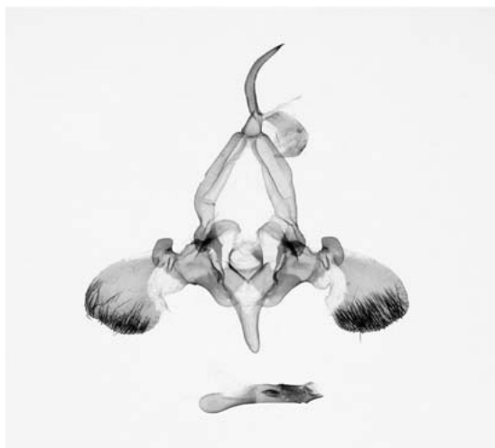
Fig. 4. Male genitalia of Camptoloma bella sp. nov.

The next four, C. interiorata , C. binotata , C. mangpua , and C. bella had typical Camptoloma wing patterns with all the fasciae and reddish patch presented. The easily recognized one is C. mangpua for its ill-developed tornal angle and curved antemedian fascia. C. interiorata is separated from the remaining ones by its finer and nearly paralleled antemedian and postmedian fasciae. C. binotata and C. bella are similar in appearance, but the discocellular fascia in C. bella is placed more outwardly than that in C. binotata .