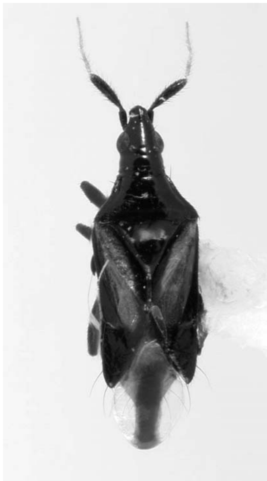
Fig. 1. Montandoniola moraguesi , dorsal view.