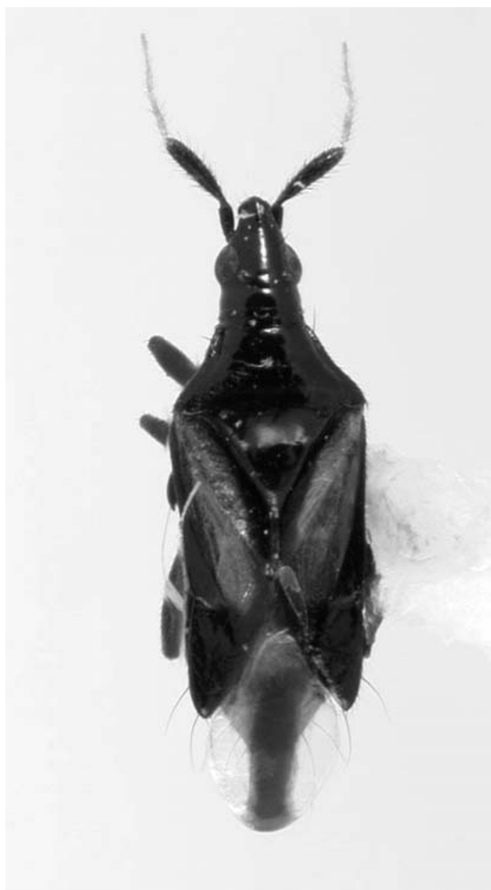
Fig. 1. Montandoniola moraguesi , dorsal view.