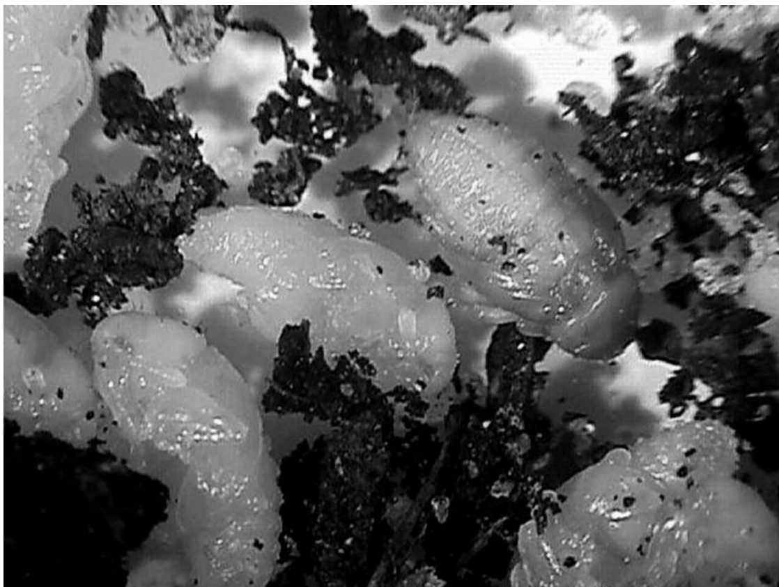
Fig. 4. Weevil pupae that exited the amaryllis bulb as larvae and pupated in the soil.