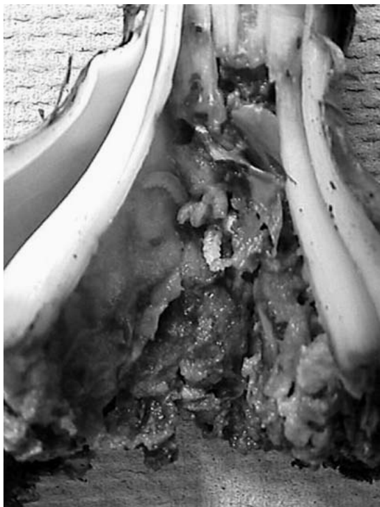
Fig. 3. Weevil larvae and heavy damage to an amaryllis bulb due to a high level of larval infestation.

pared with that obtained in the oviposition study (above) may be because eggs were dissected from the plant tissue within 24 h of oviposition (experiment 1) versus between 24 and 48 h of oviposition (oviposition study), respectively. Total time period from oviposition to adult eclosion averaged 47.4 \pm 3.7 d. Larvae stayed within the leaf tissue so number of instars was not determined. Late instars exited the tissue, moved into the vermiculite and became non-feeding prepupae. Of the larval developmental time, 9.9 \pm 2.9 d (range 3-16 d) were spent as prepupae. Newly eclosed, teneral adults were light brown in color and did not feed. It took an additional 3.8 \pm 1.1 d (range 1-6 d) for adults to become solid black and begin feeding.