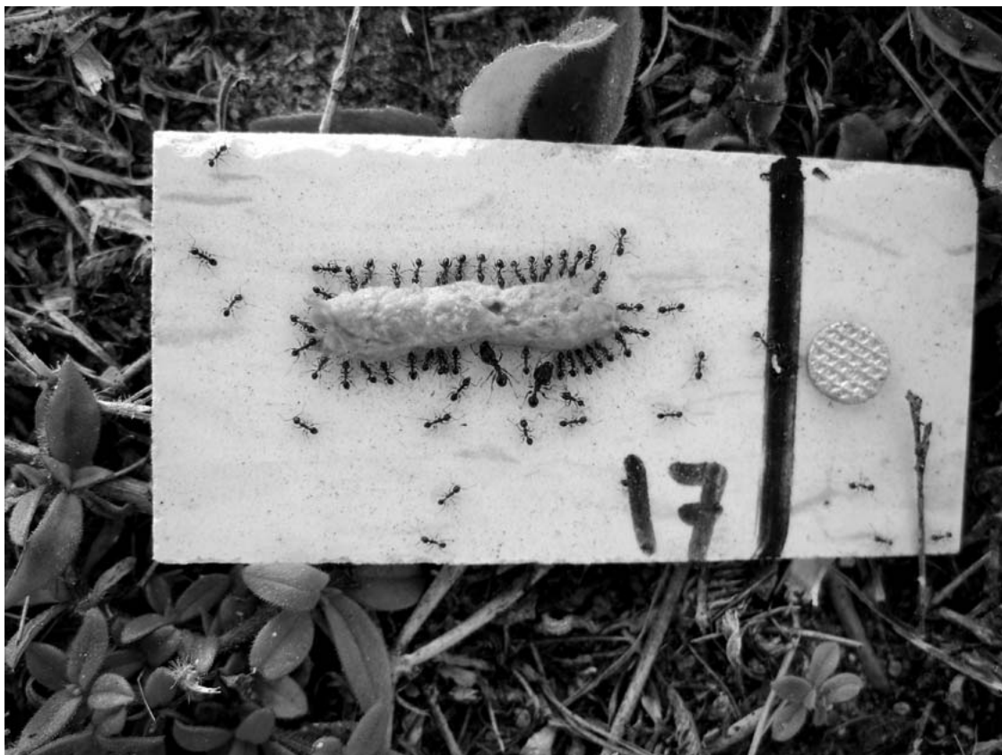
Fig. 2. Count station (approx. 3.5 \times 7 cm). Bigheaded ants are feeding on oil/protein bait. Ants on the tile to the left of the black line were counted. A nail to the right of the line holds the tile in place on the soil surface.

tained lower numbers than the other treatments. These relationships continued to 28 DAE after which data were no longer collected.