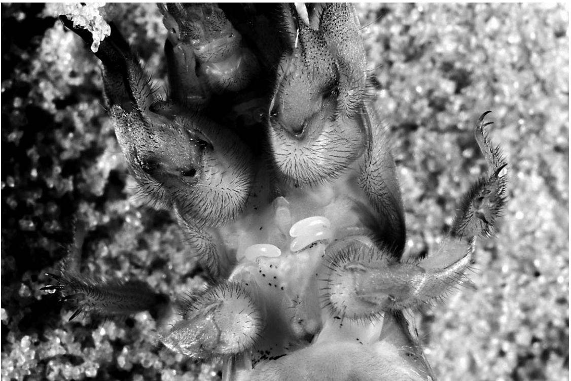
Fig. 2. Venter of the thorax of a Scapteriscus mole cricket bearing 3 eggs deposited by 1 L. bicolor female within 1 d. All are between the 1st and 2nd pairs of legs and each is \approx 1.6 mm long.

tions in northern Florida. At 26 \pm 2^\circ\text{C} and 65 \pm 5\% RH, L. bicolor (Brazilian stock) eggs incubate for 6-7 d, the 5 instars develop in 10-11 d at the end of which the host dies, a further day is spent constructing a cocoon, and the pupal duration is 6-8 weeks (Castner 1988). In an aseasonal tropical climate with continuous host availability, this might give the capability of \approx 4.5 generations each year, but because of variability among individuals in development time and because each female oviposits through her adult lifespan, we would expect completely overlapping generations. Therefore, it would not be possible to distinguish generations in the field. Effects of insect parasitoid populations on host populations are almost always calculated based on 1 discrete generation of parasitoid per host generation, so such a calculation would not be possible.