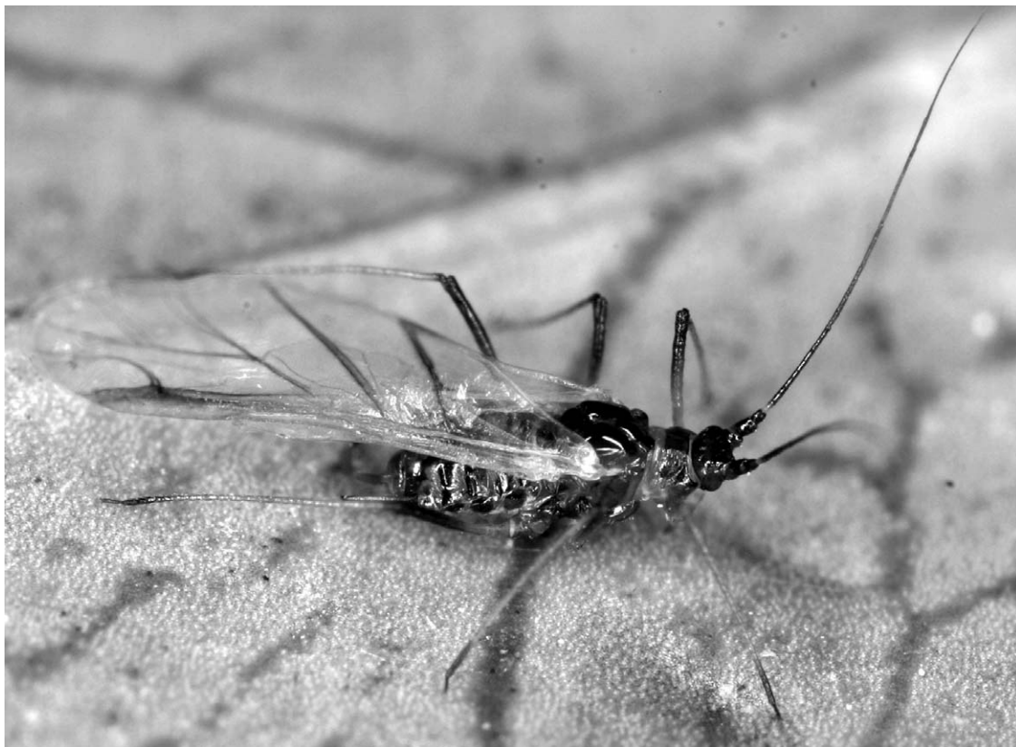
Fig. 3. Photograph of Aulacorthum corydalicola sp. nov. alate viviparous female.

tances; Ant.IV imbricate with 8-13 setae; Ant.V imbricate with 4-8 setae, primary rhinarium ciliate, longest diameter shorter (0.78-0.86 times) than middle width; Ant.VI imbricate with 3-5 short setae on Ant.VIb. Rostrum attaining posterior margin of hindcoxa; clypeus with 4 setae; URS longest seta 0.58-0.76 times as long as apical primary ones. Thorax: pronotum smooth with 2 short blunt spinal setae and 1 anterior marginal setae. Hind coxa weakly spinulose with 8-9 acuminate setae; hind trochanter wide at base, 1.43-1.67 times as long as apical width, bearing 3 setae; hind femur smooth on basal 1/2, spinulose on apical 1/2 ventrally, bearing short setae, longest seta 0.18-0.31 times as long as basal width of segment; hind tibia smooth with short setae, longest seta as long as middle width of segment; first segment of each tarsus smooth with 3 setae at apex; 2HT imbricate with 8-10 setae. Abdomen: dorsum smooth, membranous with 8 setae on tergite III, spinal 4 setae minute (less than ca. 0.01 times basal width of hind femur), marginal setae 0.01 times basal width of hind femur. SIPH cylindrical, imbricate except weakly spinulose at base, irregularly reticulated on distal end, apex well flanged. Cauda elongate, triangular, ventral