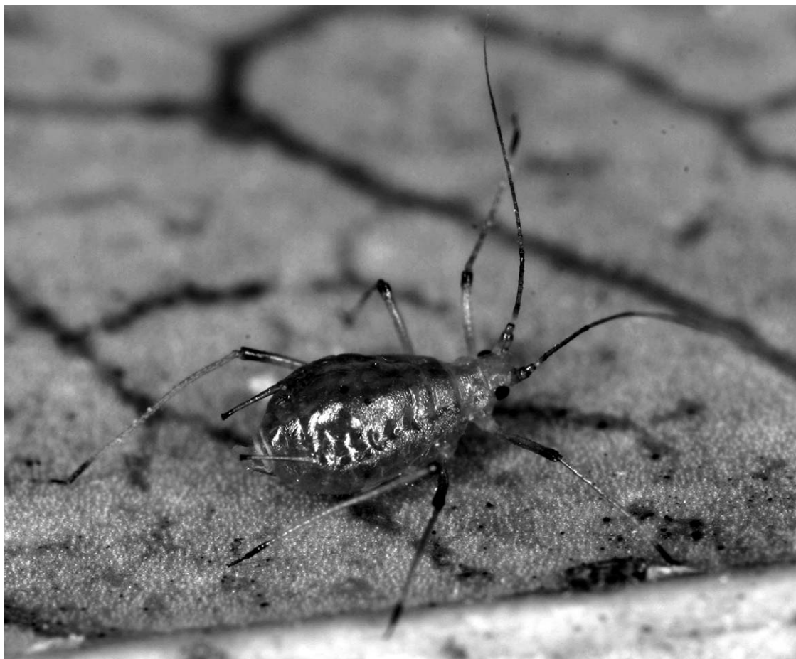
Fig. 2. Photograph of Aulacorthum corydalicola sp. nov. apterous viviparous female.

noecious holocyclic on Corydalis spp. However, it has not been determined where the summer generation survives, when the host plant loses leaves, and how the aphids overwinter on the host plant.