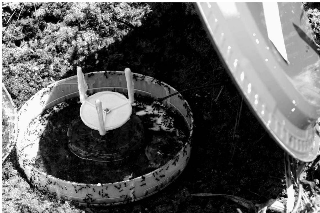
Fig. 1. The fly trap used in this survey was based on traps developed by Puckett et al. (2007) and LeBrun et al. (2008). It consisted of a white tri-stand top coated with Tanglefoot® attached to a slightly larger base by a bolt. The trap was placed inside a large fluon coated Petri dish filed with ants that swarmed into it after being placed into a disturbed mound. Flies were attracted to the disturbed ants and trapped when they landed to rest on the sticky tri-stand.

The trap was placed in the bottom half of a Petri dish (25 by 150 mm). The inside edges of this dish were coated with Fluon® and the Petri dish was settled into a disturbed fire ant mound so it acted like a pitfall trap rapidly collecting 1-10 gm of agitated ants as they swarmed out in defense of their mound. Once trapped in the Petri dish, the ants could no longer retreat into the mound. The ants usually remained in the Petri dish for 2-8 h