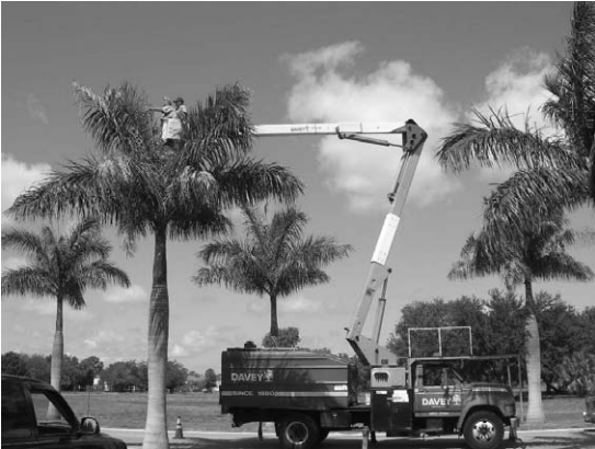
Fig. 4. Sampling of RPB populations in the field utilizing an aerial lift (bucket).

for imidacloprid, the other for dinotefuran/clothianidin. Matrix effects from naturally occurring plant compounds were eliminated from the untreated Check through multiple dilutions until a non-detectable level was reached. The study was conducted from 11 Apr to 20 Jun 2009. During the first half of the study, due to the lack of precipitation, palms were sprinkler irrigated weekly with 2.5 cm water. A total of 24.6 cm of precipitation occurred during the second half of the study.