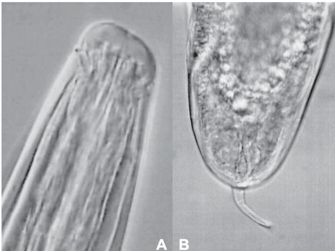
Fig. 2. Nematode infesting Acrosternum hilare adult as seen with a differential interference contrast optics microscope. 2A. Anterior end of the mermithid nematode. 2B. Posterior end of the mermithid nematode showing the caudal appendage that is common in the genus Hexamermis

(Coleoptera: Chrysomelidae) (Bozhkov & Kaitazov 1976), and the horned beetle, Diloboderus abderus Stur (Coleoptera: Scarabaeidae) (Achinelly & Camino 2008). Other stink bugs have also been infected with Hexamermis sp. These include Rhaphigaster nebulosa Poda (Manachini & Landi 2003) and the bark bug, Halys dentatus Fabricius (Dhiman & Yadav 2004). Halys dentatus was discovered to have about 9% parasitism by nematodes during a parasitoid survey in India (Dhiman & Yadav 2004). Parasitism levels are typically low for these insects, but may be a consistent contributor to natural mortality. Future research needs to focus on incidence and life cycles in relation to stink bug parasitism.