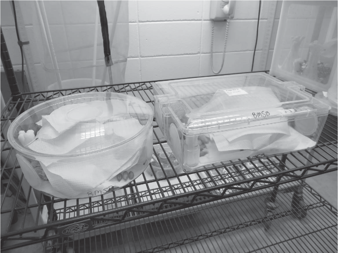
Fig. 1. Clear plastic rectangular and circular containers for rearing Halyomorpha halys .

significantly improved the BMSB rearing success. Other foods occasionally added to the diet included raisins [ Vitis vinifera L. (Vitaceae)], apple [ Malus pumilla Mill. (Rosaceae)], papaya [ Carica papaya L. (Caricaceae)], mango [ Mangifera indica L. (Anacardiaceae)], okra, orange [ Citrus sinensis (L.) Osbeck (Rutaceae)], tangerine [ Citrus tangerine (Tanaka) Tseng (Rutaceae)], cucumber [ Cucurbita sativus L. (Cucurbitaceae)], jalapeño [ Capsicum frutescens L. (Solanaceae)], tomato [ Lycopersicon esculentum Mill. (Solanaceae)], strawberry [ Fragaria × ananassa (Rosaceae)], common ragweed [ Ambrosia artemisiifolia L. (Asteraceae)] bouquets and other seasonal produce. Layers of Kimwipes® Kimberly-Clark and paper towels were placed inside the containers to provide an oviposition substrate, hiding places, and additional surface area. Egg masses were hand collected every other d. This method proved to be very effective for obtaining fresh high quality eggs (Fig. 2). To avoid egg predation by adults and to avoid overcrowding, egg masses were collected regularly and placed in a separate labeled container. Nymphs tended to feed on the eggs, and