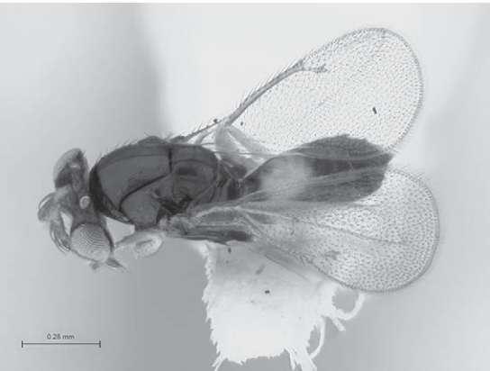
Fig. 2. Male Aprostocetus ( Aprostocetus ) sp. (all females were slide mounted for identification and were not photographed prior to mounting). The color version of this figure is available online in Florida Entomologist 96(2) (2013) at http://purl.fcla.edu/fcla/entomologist/browse .