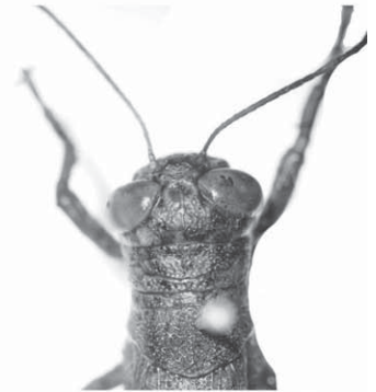
Image 4. Clonacris kirbyi Finot Dorsal view of head

Fig. 1. Clonacris kirbyi Finot collected at Patgaon, Taluka Chandgad, Dist., Kolhapur [N 16° 07' 40.66" E 73° 56' 04.15", 2098 ft (639.5 m) asl], northwestern Ghats, Maharashtra, India.