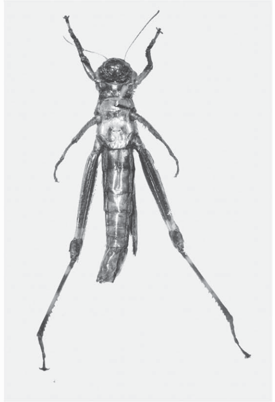
Image 2. Clonacris kirbyi Finot Ventral view