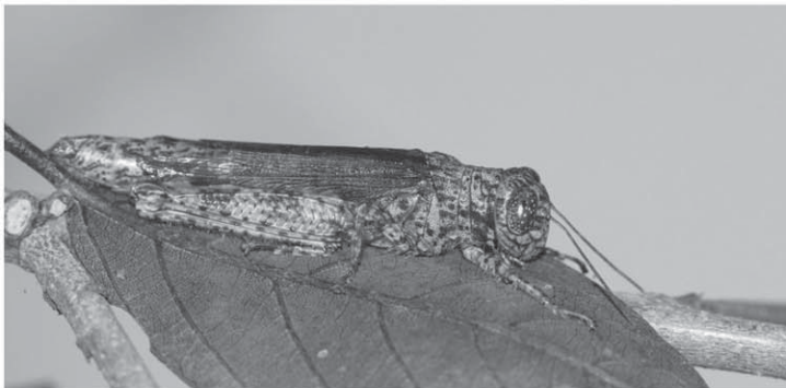
Image 3. Clonacris kirbyi Finot Lateral view