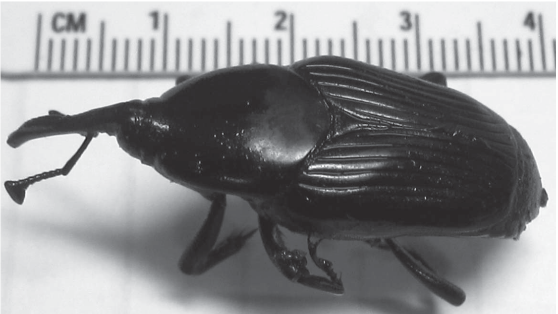
Fig. 2. Rhynchophorus palmarum male from Alamo, Texas.