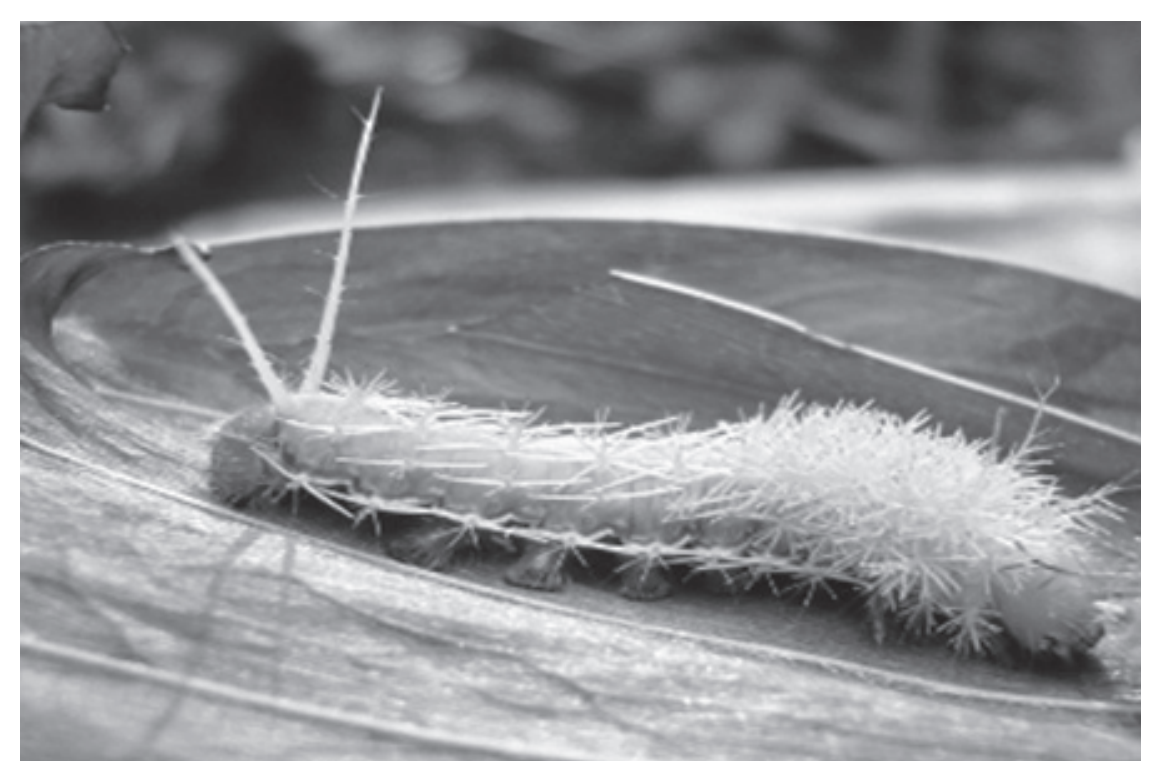
Fig. 2. Caterpillar of Periphoba hircia (Lepidoptera: Saturniidae).

an area of 500 ha in the Peruvian Amazon where it was considered a pest (Couturier & Kahn 1993). It was a secondary pest of Eucalyptus urophylla S. T. Blake (Myrtales: Myrtaceae) in San Carlos, Colombia with outbreaks in isolated areas during the rainy season (Rosales 2001).