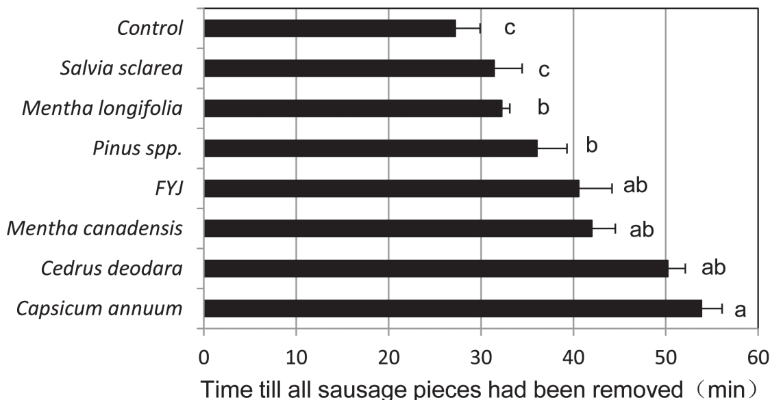
Fig. 3. Effect of plant essential oils on the time (min) required by Solenopsis invicta workers to remove all 8 of the ~ 62.5 mg fragments of sausage placed on a piece of filter paper treated with an essential oil. Each piece of filter paper was placed 15 cm from the perimeter of the fire ant mound. FYJ is a mixture of menthol, methyl salicylate, camphor, eucalyptus oil and eugenol. Means ( \pm SE) followed by the same letter are not significantly different (LSD) at level of 0.05.

tested. The concentration of essential oils used in this experiment was 10^{-6} ml/ml, but different concentrations may alter the effectiveness of a repellent (Chen 2009). Future research should consider this possibility. Our study also revealed that the number of worker ants involved in foraging activities tended to increase over time. This may due to the gradual decrease of the repellent effect of essential oils. It is probable that lower repellency occurred because the outdoor air-flow accelerated the evaporation of the essential oils. Perhaps micro-capsules could be developed to ensure a greater stability of the repellent effects.