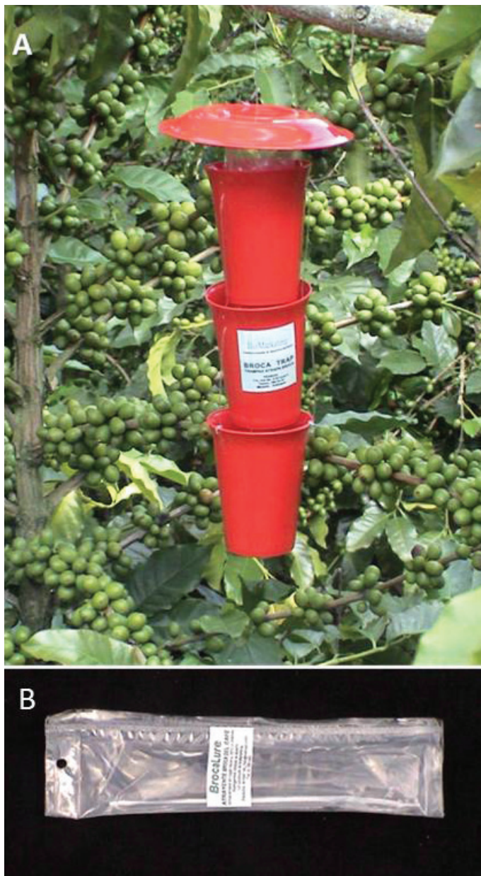
Fig. 1. A red funnel trap used to capture CBB ( Hypothenemus hampei ) (A) and the methanol-ethanol lure (3: 1 ratio) enclosed in a semi-permeable membrane (B). CBB were collected in a plastic container containing 200 mL of soapy water.

populations declined through the smaller harvest (Mar–Jun). Fewer CBB were collected in the small coffee farms (Viterbo) (averages of 38 to 105 CBB per trap/week), however, a similar seasonal trend was observed, with captures peaking from Jan–Mar (Fig. 2B). The start of the peak flight activity on smaller farms (Jan) again correlated with higher berry infestation (> 2.5%), and dropped later in the year as flight activity declined. A positive linear correlation (Pearson coefficient) between number of CBB captured and percent berry infestation was observed for both large ( r^2 = 0.90 ) and small ( r^2 = 0.68 ) farms. A similar relationship was reported by Pereira et al. (2012) in Brazil. However, their regression model could not determine an action threshold for CBB, since the intercept indicated that no CBB were caught at a low field infestation ( \approx 3 to 5% berry infestation), which was not observed in our study.