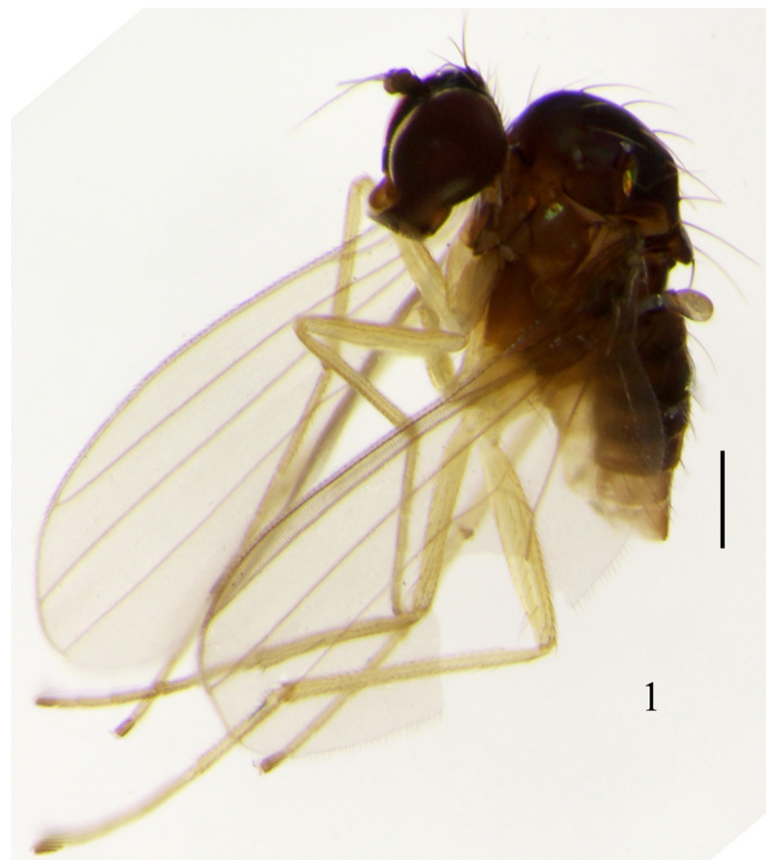
Fig. 1. Chrysotimus taiwanensis Wang & Yang, sp. nov., male: habitus, lateral view, scale bar = 0.4 mm.

Thorax metallic green with pale gray pollen, mesonotum and scutellum brilliant. Hairs and bristles on thorax brown; 4 dc, acr absent; scutellum with 2 pairs of bristles. Propleuron with 1 yellow bristle on lower portion. Legs including coxae yellow with 5th tarsomeres brown. Hairs and bristles on legs brownish; coxae with yellow hairs and bristles; fore coxa with 3–4 anterior and apical bristles, mid coxa with 2–3 anterior and apical bristles, hind coxa with 1 brown outer bristle near middle. Fore femur with 1 short av and 1 short pv apically; mid and hind femora each with 1 av and 1 pv apically. Mid tibia with 2 ad and 1 pd, apically with 4 bristles; hind tibia with 2 ad and 1 pd, apically with 3 bristles. Fore tarsomere 1 with row of 8–10 v, mid tarsomere 1