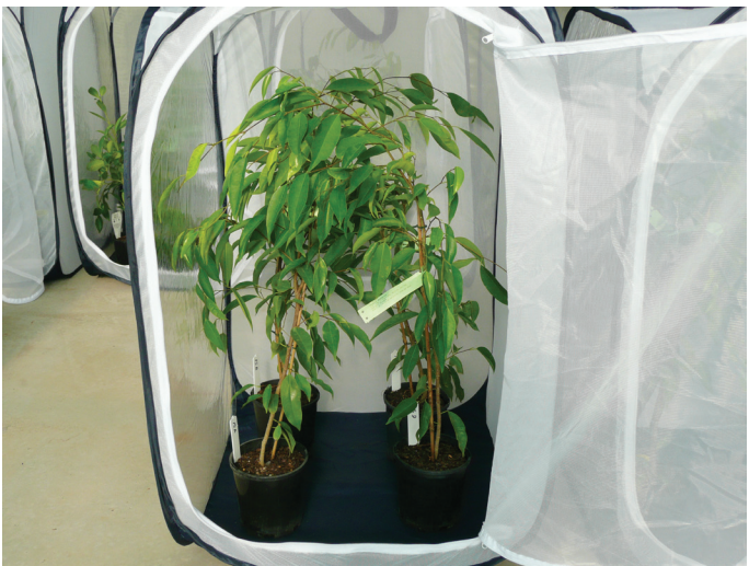
Fig. 2. Four Ficus benjamina plants inside a collapsible cage.