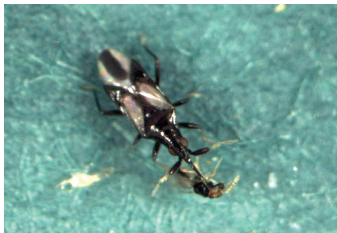
Fig. 3. Montandoniola confusa (Anthocoridae) attacking Thripastichus gentilei . This predator also feeds on the eggs and immature stages of Gynaikothrips species.