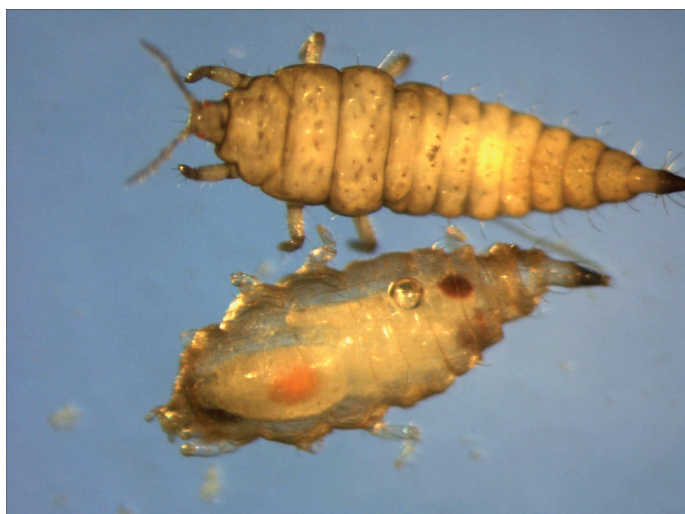
Fig. 1. Two immatures of Gynaikothrips uzeli : the upper individual is a normal larva, and the lower one displays the transparent, swollen appearance of a parasitized larva. The parasitoid, Thripastichus gentilei , develops with a polarity that is reverse relative to the host.

For experiments with T. gentilei , cuttings were sorted into replicates so that cuttings within a replicate had a similar number of eggs. Within a replicate, cuttings were randomly assigned a life stage treatment (1st instar, 2nd instar, prepupa, pupa I, and pupa II) similar to that of Tavares et al. (2013). To achieve uniform life stages, immatures were allowed to develop from eggs inside leaf galls to a certain stage; then all individuals not at that prescribed stage were destroyed. However,