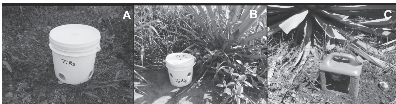
Fig. 1. Handmade designs of traps evaluated for capturing agave weevil on "maguey espadín" in Guerrero, Mexico. (A) TOCCI trap, (B) TOCCIA trap, and (C) container trap. In the 2nd experiment, TOCCIA traps were buried in the soil to the level of the holes.

In the 1st experiment, we evaluated 3 types of traps to capture the agave weevil: 1) TOCCI trap (Fig. 1A) at ground level (as recommended