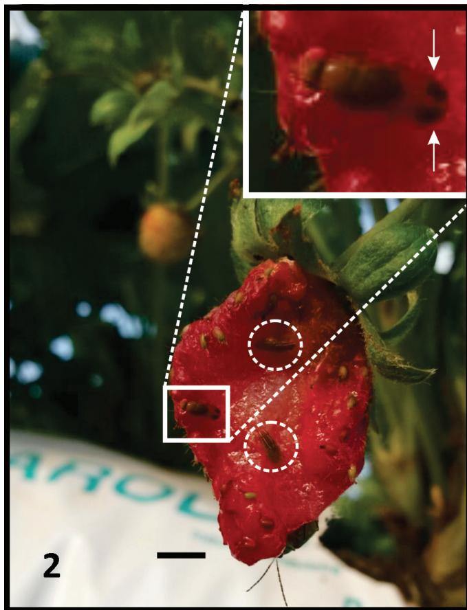
Fig. 2. Damaged strawberry in the field with drosophilid flies including a Drosophila suzukii male (inlet) with its characteristic wing black dots (arrows) and 2 adults of Zaprionus indianus (white circles), scale bar = 5 mm.

We thank the CAPES Foundation, the National Council of Scientific and Technological Development (CNPq), the Minas Gerais State Foundation for Research Aid (FAPEMIG), and the Arthur Bernardes Foundation (FUNARBE) for grants provided to this work.