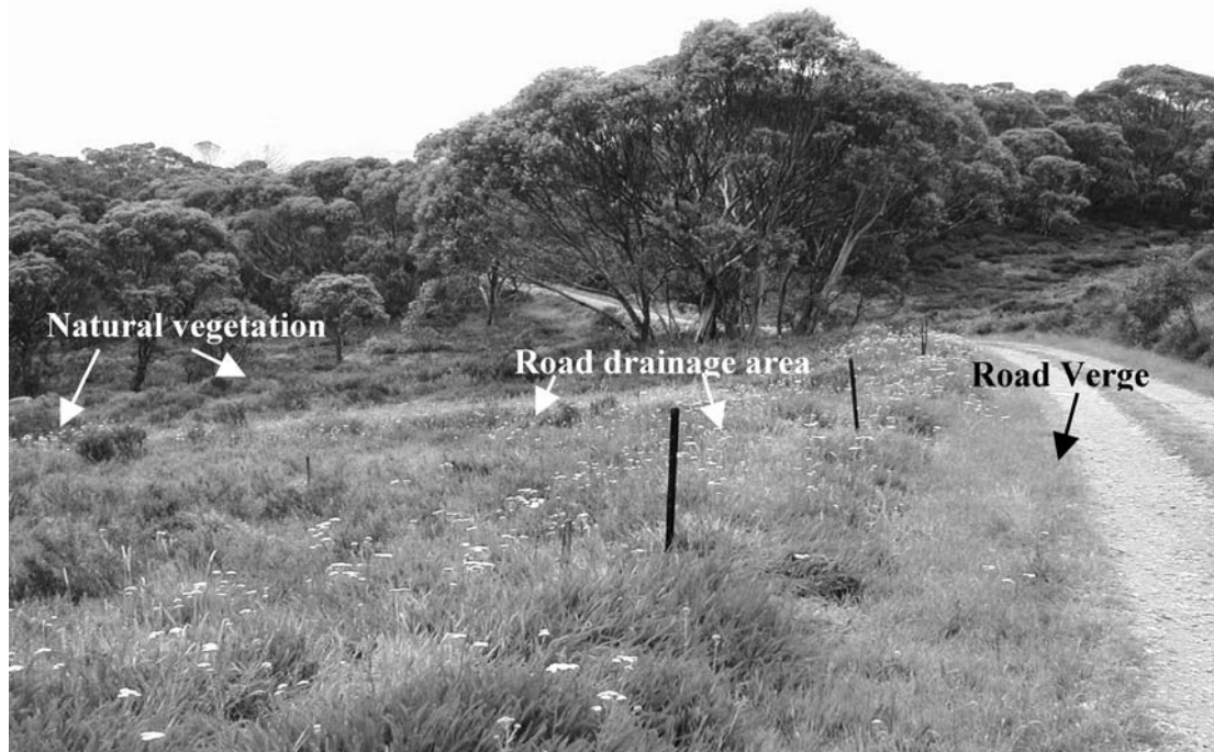
FIGURE 2. Photograph of typical study sites (Schlinks Pass) showing the three ecotypes examined: natural undisturbed area, road drainage area, and road verge.

Plant cover abundance was measured using an adapted Braun-Blanquet method, as a percentage of the proportion of ground covered by the vertical projection of foliage (Mueller-Dombois and Ellenberg, 1974). Plant composition was compared using one way ANOVA (SPSS Version 10.0 for Windows) (Coakes and Steed, 2000), with site as a block. Mean and standard deviation for individual species and species type were calculated and are presented in Tables 2 and 3.