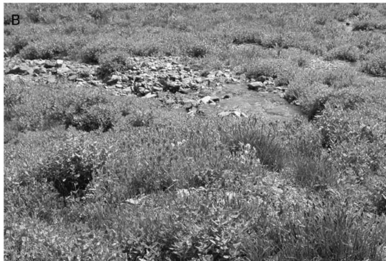
FIGURE 3. Examples of the plant associations found at opposite ends of the primary DCA axis, with characteristic (A) Arctostaphylos uva-ursi (bearberry) and (B) Tofieldia glutinosa – Carex lenticularis (false asphodel–Kellogg sedge).

Bowman and Seastedt, 2001; Löffler and Pape, 2008; or isolation and dispersal: e.g., Marchand et al., 1980; Molau and Larsson, 2000; Vittoz et al., 2009), simple geomorphic indicators account for much of the variation in composition and thus in regional diversity. To the extent to which we do capture soil conditions such as soil moisture, other geomorphic variables explain more variance. Overall, the use of geomorphic variables that are relatively easy to determine in the field proved to be a useful approach in an effort to understand how climate is modified at the plant scale.