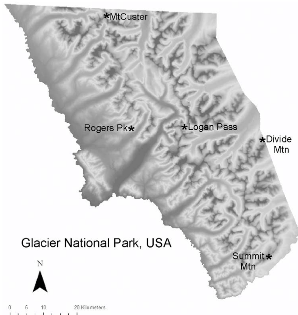
FIGURE 1. The locations of the sites for which Daymet climate data was derived for descriptive context. The latitude and longitude of Logan Pass are 48.6952°N, 113.7180°W.