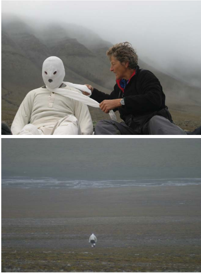
FIGURE 2. Lead author disguised as a polar bear approaching a group of Svalbard reindeer. Limited supplies of white clothing left the back of the observer uncovered.

displacement distance by the reindeer after taking flight. All response distances were measured with laser monoculars (Leica Rangemaster 1200 Scan; 1 m accuracy at 1000–1200 m).