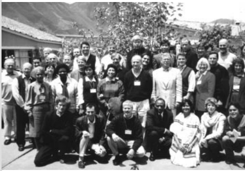
Participants at the first meeting of the Mountain Forum Council, Urubamba, 28 September 1999–1 October 1999.

At the kind invitation of the International Potato Center (CIP), the first meeting of the Mountain Forum Council took place in Urubamba, Peru, from 28 September 1999–1 October 1999. All 22 members of the Council, who had been nominated by their respective regional/global nodes, FAO, and the Swiss Agency for Development and Cooperation (SDC) were in attendance, as well as 20 special invitees, observers, and node managers. A detailed report of the meeting is in preparation.