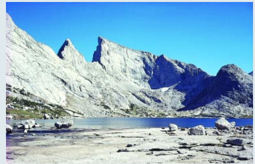
FIGURE 4 Deep Lake, East Temple, and Steeple Peaks, an area most attractive to climbers.

Widespread among environmentalists since John Muir is the unshakable conviction that