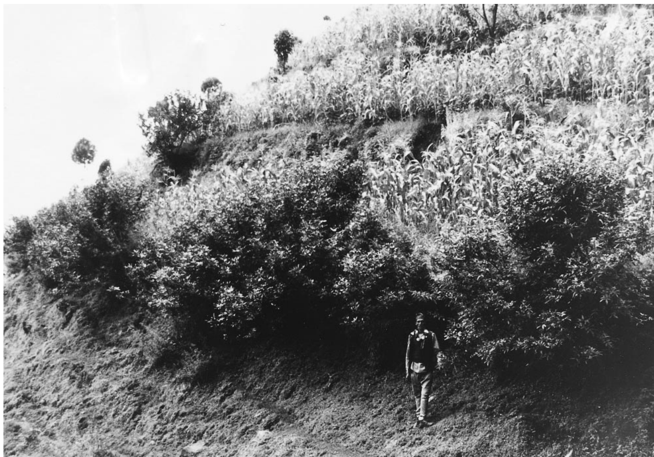
FIGURE 2 Cultivation of timur on terrace risers on private lands.

germination. Timur can also be propagated vegetatively from branch cuttings or seeds. Timur flowers regularly around April to May and produces constant fruit yields over the years. However, hailstorms in spring can destroy the flowers.