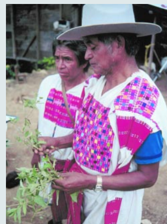
FIGURE 3 Community members discuss which medicinal plant species to include in gardens.

founding editor of the Journal of Ecological Anthropology and is currently a fellow with the US Environmental Protection Agency STAR program. He has conducted ethnobotanical research in montane regions of Mexico, Ecuador, and Belize.