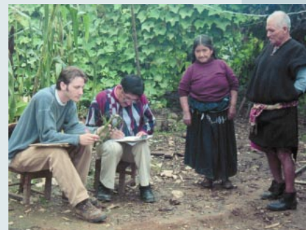
FIGURE 4 The author conducting an interview on medicinal plants in Tzeltal Maya, one of two Maya languages spoken in Highland Chiapas.