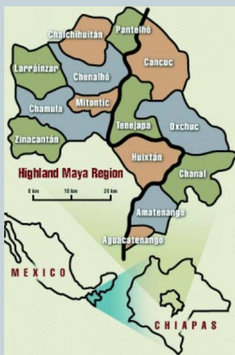
FIGURE 1 Map of the highland region in Chiapas, Mexico—an area characterized by a polarized political climate.

last few decades, poverty, population pressure, environmental degradation, and political conflict have intensified in Chiapas. Widespread political unrest and violence continue despite a "cease-fire" between the Mexican government and supporters of the Zapatista movement that first appeared in 1994. Despite these odds, projects aiming to support traditional indigenous health care while exploring ways of conserving local biodiversity are being continued in Highland Chiapas.