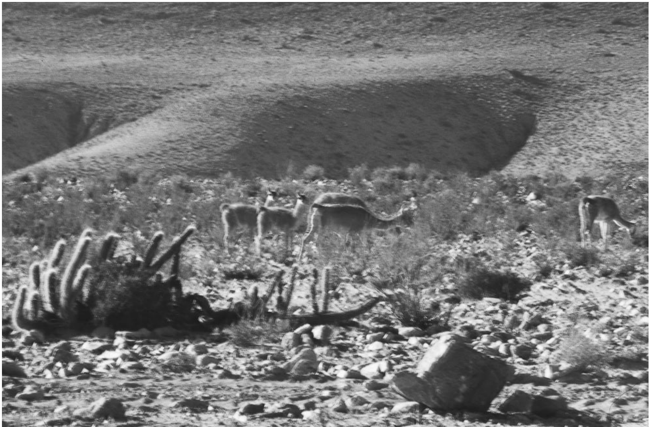
FIGURE 6 Grazing guanacos in pre-puna shrubland about 30 km southwest of Putre, outside of Lauca National Park. This habitat is poorly represented within the park.

leading to the creation of Las Vicuñas National Reserve adjacent to Lauca as an area where more active management can take place. Careful consideration is now being given to how herds of vicunas can be managed so that an industry can be developed by indigenous populations to harvest valuable vicuña fur in a sustainable manner and without violating the restrictions of CITES for this endangered species. Management and protection of Andean huemul, guanacos, and a variety of rare plant species in prepuna habitats can best be implemented by adding larger areas of these habitats to the existing park (Figure 6). This issue is discussed in more detail below.