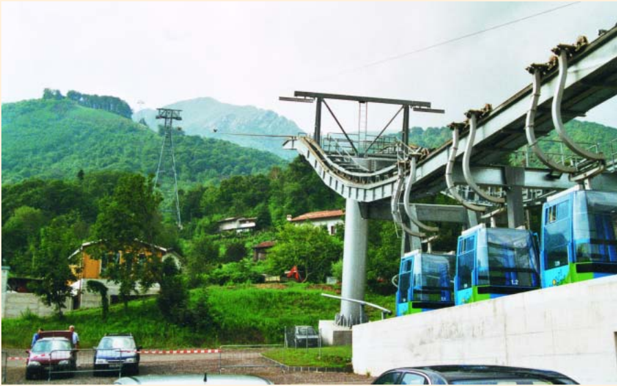
FIGURE 4 The Monte Lema aerial cableway in the Canton of Ticino, Switzerland, in the southern part of the Alps. Tourism is a major source of jobs and has prevented out-migration, especially in poorer alpine regions.

services under the pressures brought about by a liberalized economy. Without such services, the Alps will once again become an area of out-migration, as they were in the years following the Second World War.