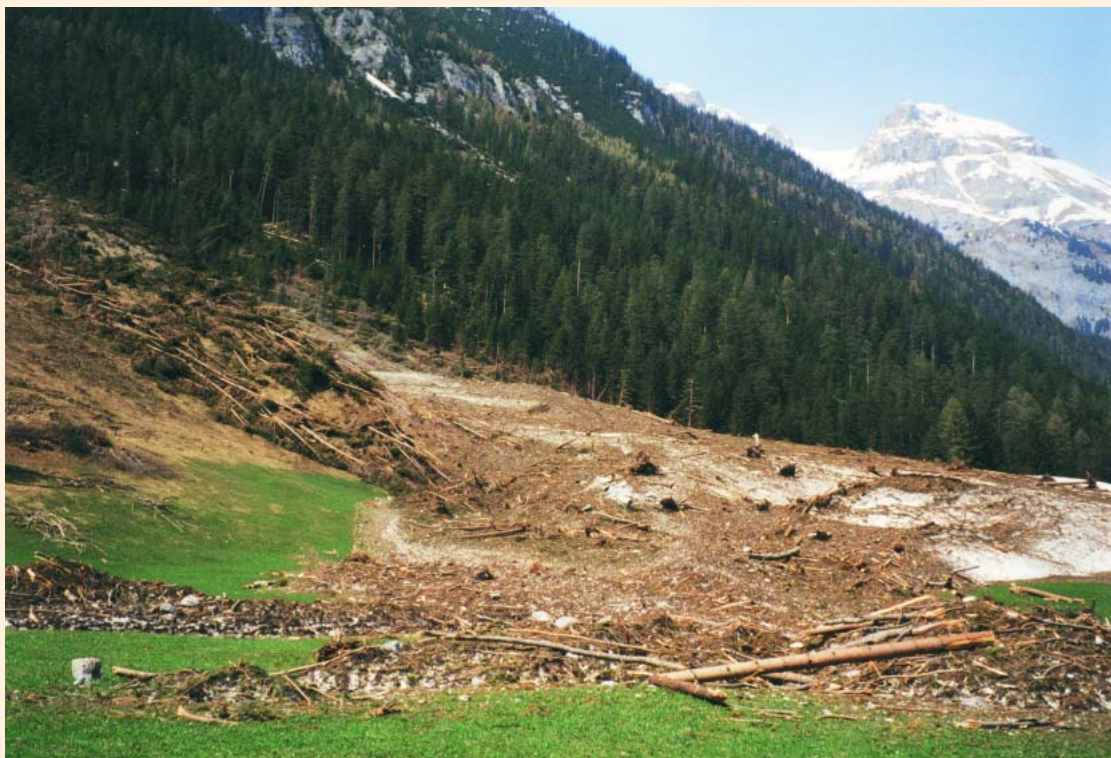
FIGURE 2 Protective forests in the Alps serve crucial environmental functions, but they are not always immune to the forces of nature (eg, as in the case of Goms in the Valais, shown here).

Local and regional processes thus become complete. It is too often forgotten that local and regional markets in the Alps have great potential, that the alpine ecosystem is unique, and that different ethnic groups perform major cultural services in the Alps (Figure 1).