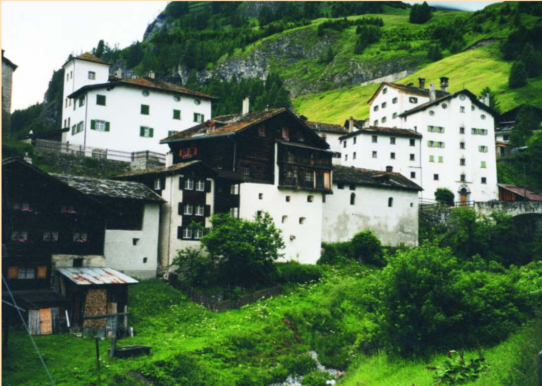
FIGURE 1 Long-settled alpine villages such as Mesocco in the Grisons reflect local cultural development and are also a point of attraction for the tourism industry.

simply a quick thrill? Should they be seen as a habitat and a cultural landscape or a global model for sustainable development? Depending on the personal point of view of the observer or of the people who inhabit the Alps, they may be all or only one of these things.