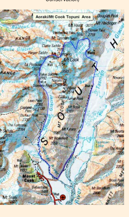
FIGURE 4 Map of Aoraki/Mount Cook topuni area.