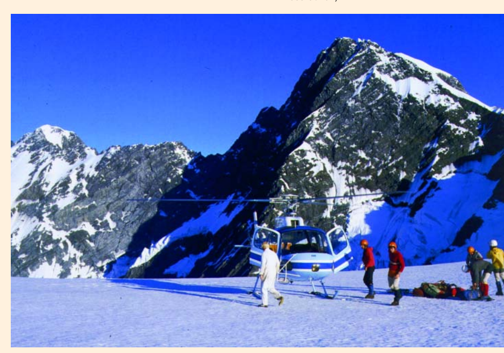
FIGURE 3 A helicopter unloads climbers on Faith Col. Mt Hopkins behind.

Much filming of the movie Vertical Limit occurred in the park, with extensive use of helicopters, including in the Hooker Valley.