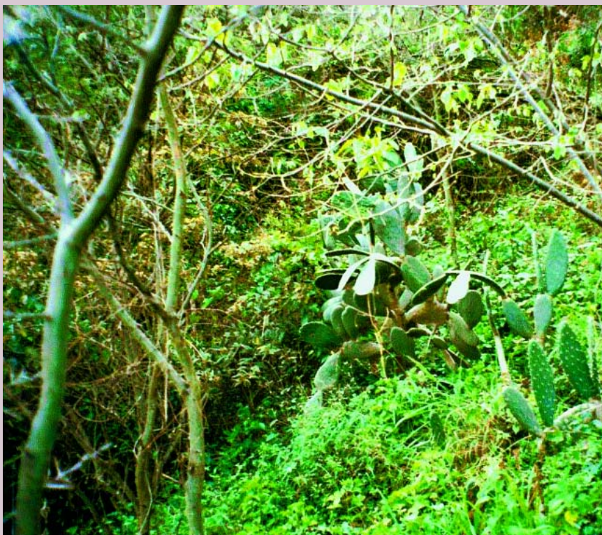
FIGURE 1 The project includes planting of opuntia among native, drought-resistant trees that can provide fuelwood.

fruits, forage, and live barriers; recovery of areas eroded by overexploitation and inadequate management; increased sensitivity among political leaders regarding the problems of desertification and the need to support a second phase of the project; decision-making by community-based organizations; and commitment of the community to the activities of the project, based on agreements between authorities, academia, and the community. In 1999, the project was honored with the “Saving the Drylands” Award given by the United Nations Environment Programme (UNEP) at Recife, Brazil, during the Third Conference of Parties (COP 3) of the Convention to Combat Desertification (CCD).