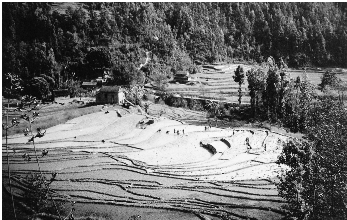
FIGURE 4 Rice transplanting on khet terraces low down on the valley side. Remnants of sal woodland in the background, in various states of degradation.

the main monsoon. Thus, these terraces are subjected to continued irrigation for a long period of time. Single-irrigated khet land is subject to natural climatic conditions during the premonsoon period and to artificial irrigation during the monsoon season.