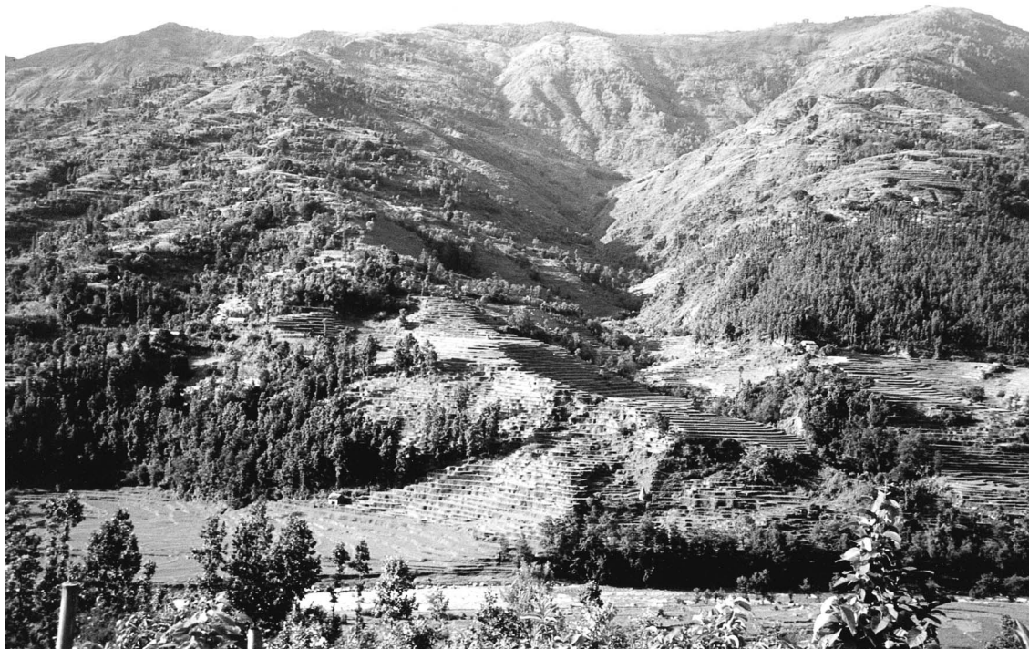
FIGURE 3 General view of the Dee subcatchment of the Likhu Khola (visible in the foreground), with khet terraces on the lower slopes and patches of woodland and bari terraces on the higher slopes. A few landslide scars are visible.

relatively gently outward-sloping rainfed terraces, frequently with a ditch at the back of the terrace to minimize overland flow and erosion. Khetland represents the system of irrigated terraces usually used for the growing of rice (Figure 4). It is important to make the distinction between double-irrigated and single-irrigated khetland. Double-irrigated khetland produces 2 rice crops, 1 during the premonsoon period and 1 during