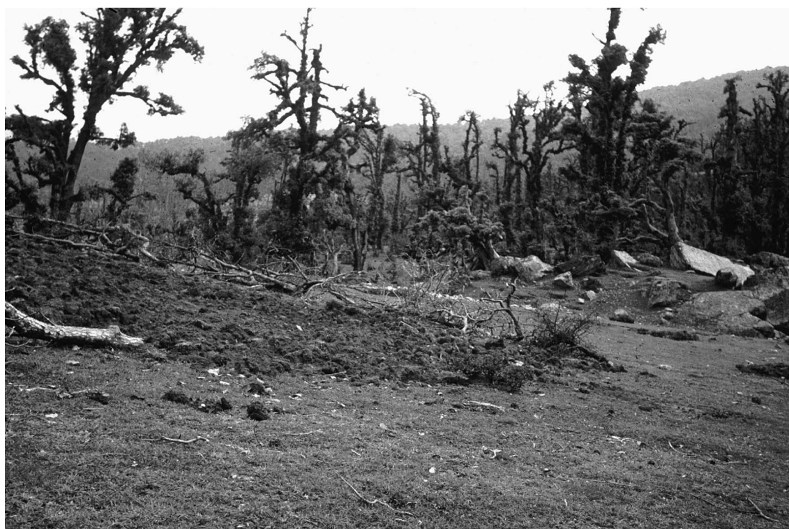
FIGURE 2 Trees in forests are heavily lopped, resulting in conversion of dense to open forests over time. The photo shows heavily lopped oak trees ( Quercus leucotrichophora ) and expansion of cultivation in an open area.