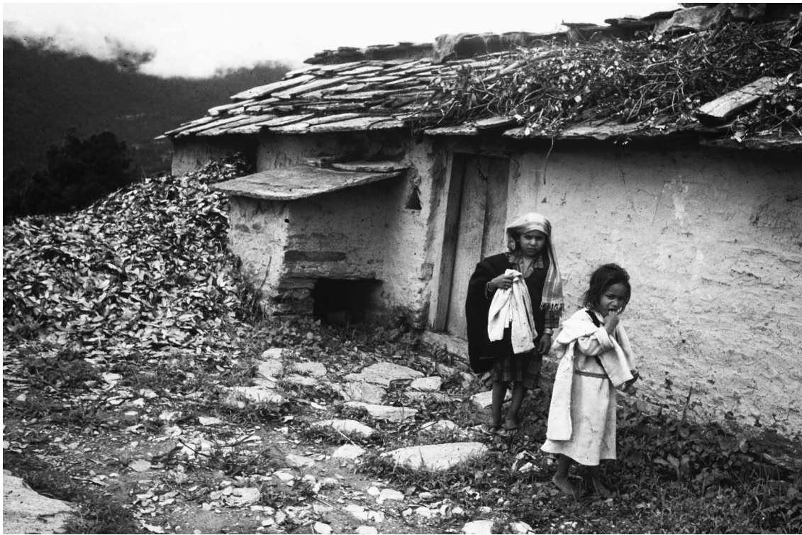
FIGURE 3 A heap of manure outside a livestock shed. Leaf litter from the forest is used as bedding material in such sheds, and the mixture of litter and animal excreta is used as manure in fields. Higher manure input to sustain cash crops results in more intense litter removal from forests.

Himalaya), began cultivation of many costly medicinal plants that used to be harvested from the wild, thus generating income without any significant loss of food crop diversity (Maikhuri et al 2000).