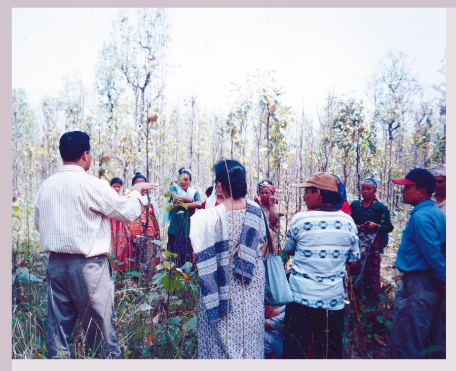
FIGURE 1 Male forester instructing rural women on how to clean the forest. This gendered distribution of roles is still the dominant one in Nepal.

als, at the same time creating conditions under which rural women can demand respect and inclusion by building synergies at various levels. This requires a focus on developing the skills of change agents within communities and agencies.