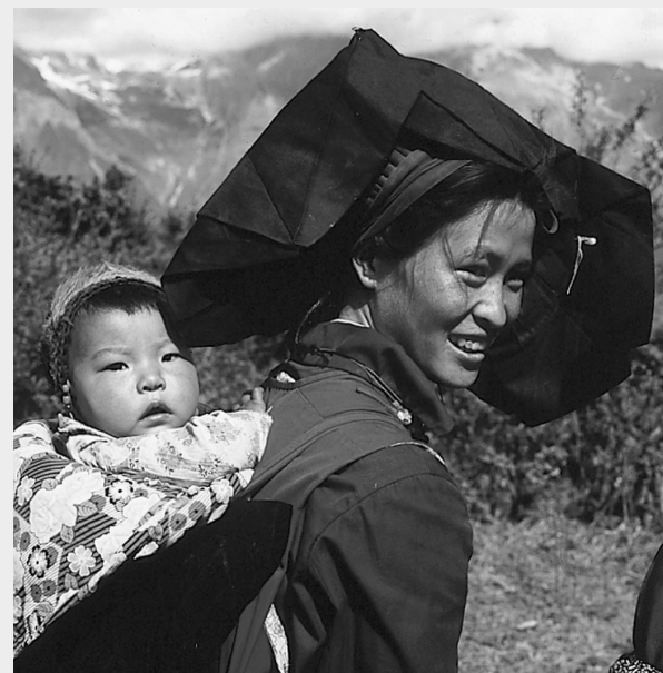
FIGURE 1 Yi lady with baby, northwestern Yunnan, China. The Yi people are one of the many ethnic mountain minorities who inhabit this diverse mountain region.

UNU greatly appreciates the support given to IYM2002 events by the Ministry of Education, Culture, Sports, Science and Technology of Japan and by the Ministry of the Environment and the Forest Agency of Japan. UNU has also cooperated closely with Hokkaido University and the mountaineering community in Japan, the Institute of Geography at the University of Berne, Switzerland, and UNESCO/MAB in Japan.