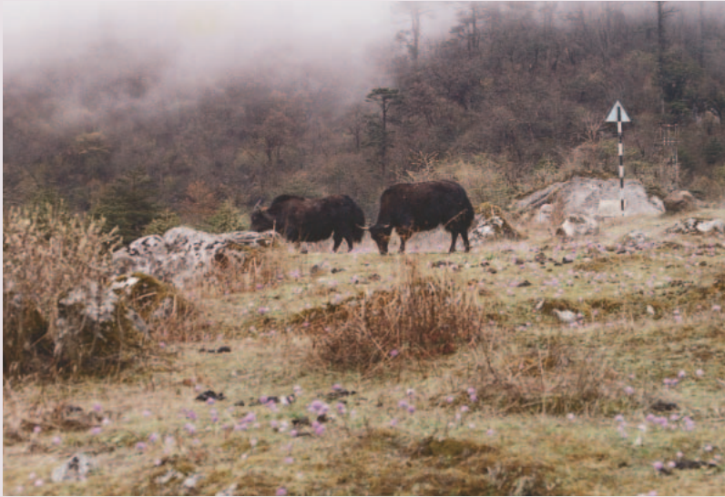
FIGURE 3 Yaks grazing on the alpine pastures in the buffer zones of the KBR.

tions under which annual income per household ranged from US$685 to US$1657 and literacy from 30% to 98%, with predominantly school-level education. The practice of livestock rearing to supplement agriculture and generate direct income is quite prevalent. Open grazing (eg, yaks grazing on alpine pastures, see Figure 3) is practiced for the most part, with limited stall feeding. The use of NTFPs and medicinal herbs is a common form of supplementary income.