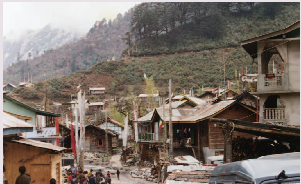
FIGURE 4 A high-altitude permanent fringe area settlement near the KBR.

Hence, conflicts are likely to crop up only when the real pressure of conservation restrictions begins to affect socioeconomic conditions and the traditional practices of people living in fringe area settle-