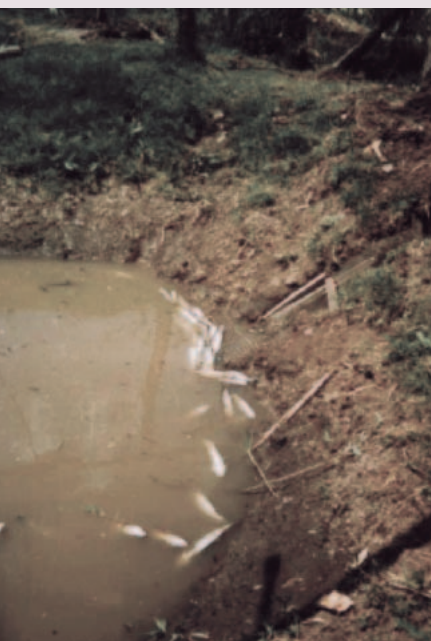
FIGURE 4 Loss of fish due to over-abstraction of water upstream.

Water Users’ Associations (WUAs) started up in the late 1990s as a strategy employed by the larger Water Awareness Creation Campaign initiative, which had been operating for a few years with the support of the Laikipia Research Programme and the Ministry of Water Development. The WUA approach is a relatively new strategy in the