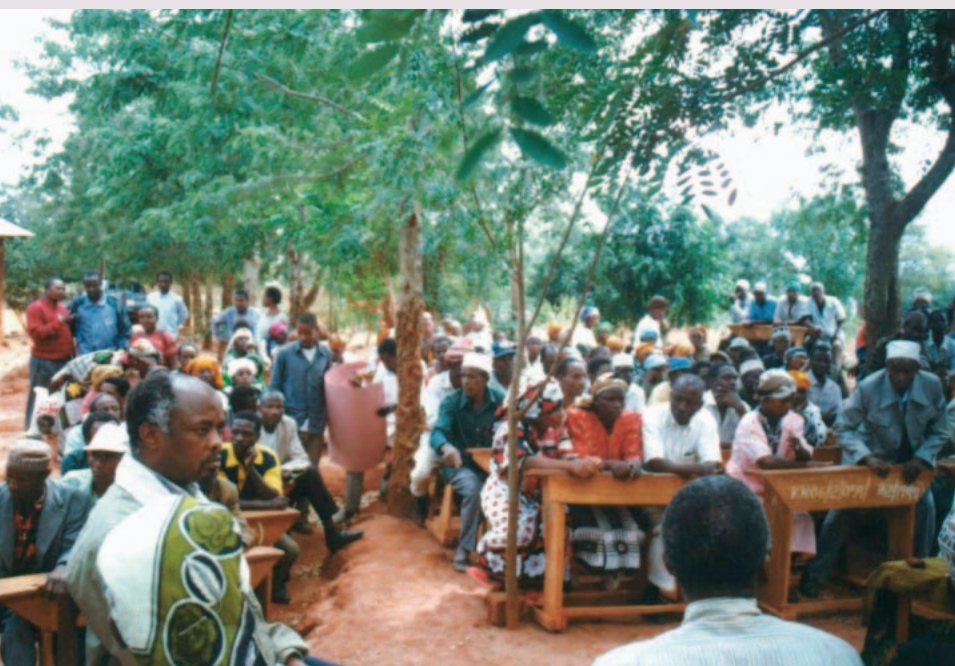
FIGURE 6 Negotiations among stakeholders at all levels are effective in resolving conflicts over resource use.

New water users are required to consult the Association through the Executive Committee, who commissions an overview assessment of the water situation to determine the implications of proposed new users. If it is determined that new uses will cause undesirable effects that could lead to conflicts, a general meeting is convened to discuss the best ways of allocating water to new applicants, using existing water abstraction points without affecting the river flow downstream. Even where water permits from the Water Office exist,