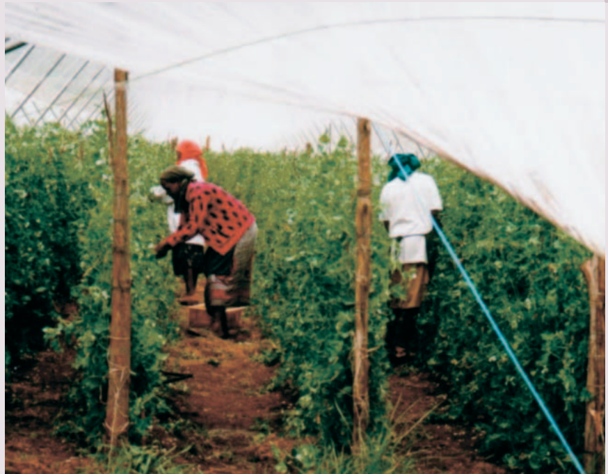
FIGURE 2 Horticultural production: the conversion of former livestock–wheat field systems into large-scale irrigated horticulture in the footzones of Mount Kenya has introduced a new dimension of water demand in the area.

In view of this complex social structure and the rapidly growing population,