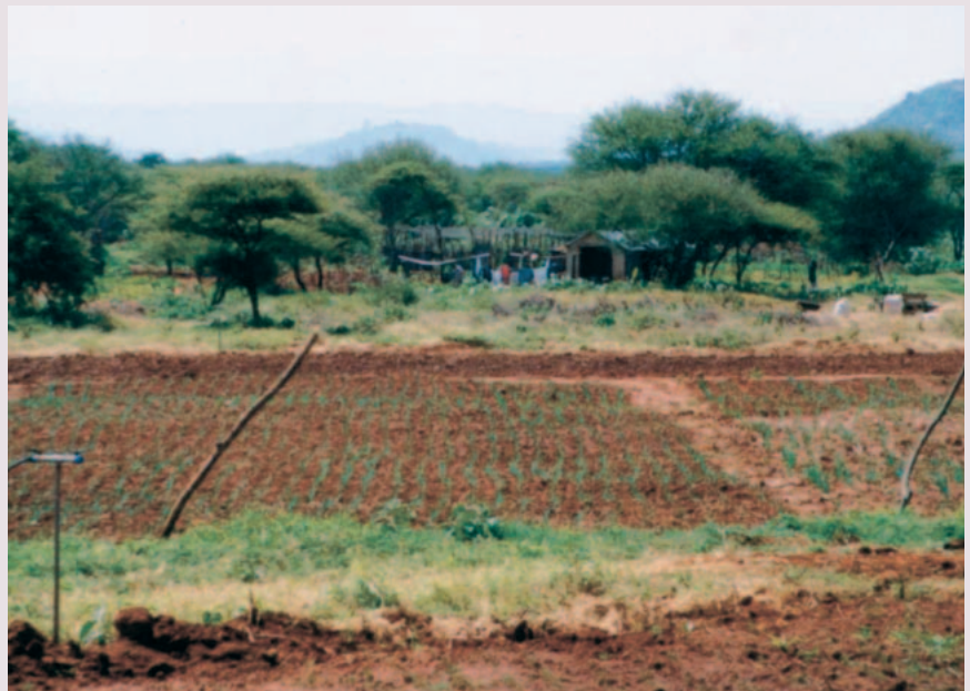
FIGURE 3 Crop production in the marginal pastoral area: the demand for water continues to grow as more marginal areas further north are used for irrigation agriculture.

with ensuing social, cultural, racial, economic, and political disparities, a key challenge is to achieve equitable universal allocation and distribution of river water resources. Further complications of the issue are (1) that people perceive water as a God-given resource—with the implica-