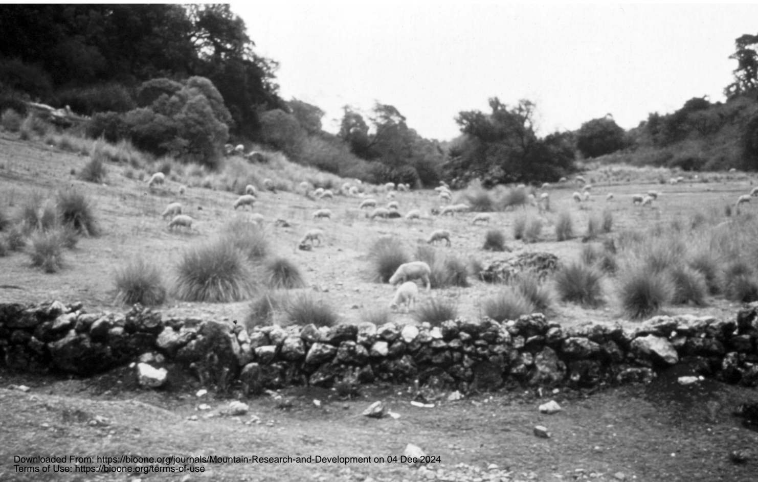
FIGURE 3 Highland landscape in the Cuchumatán range.

We interviewed 10 farmers from each village in order to begin to compare present-day maize diversity with data collected earlier in this century (such as Stadelman 1940; Mangelsdorf and Cameron 1942; Anderson 1947; McBryde 1947; Wellhausen et al 1952). All farmers we interviewed were men. When the authors did speak to women, who were often shucking corn of various types on their house porches, we received very stilted responses regarding maize diversity. Women used the generic names of yellow, red, white, and mixed to