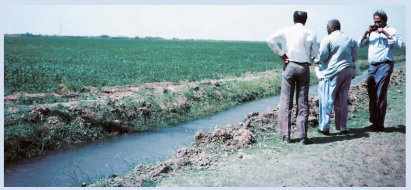
FIGURE 2 Nile Basin partners survey the Gezira irrigation scheme in Sudan.

if southern Sudan became an independent country, Egypt would have to make fresh agreements with the new Southern Sudan in order to hope to get some of the water trapped in the internal lakes of Southern Sudan" (Figure 2).