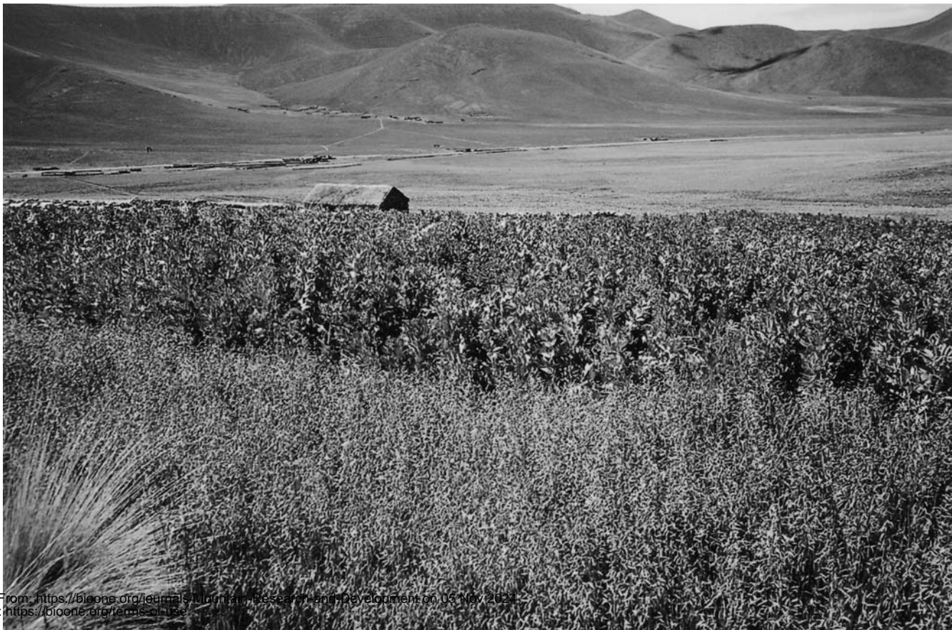
FIGURE 5 Community livelihood in Chorcoya depends on seasonal migration, grazing, and cultivation where water is available. Pictured here are oats and broad beans irrigated from a hillside spring.

Although pastoralism is a crucial element in the livelihood of alti-plano people, like crop farming (Figure 5), it offers security rather than a satisfactory income or a good quality of life. It is uncertain whether livelihoods that combine pastoralism, some cultivation, and seasonal migration will be able to meet the rising