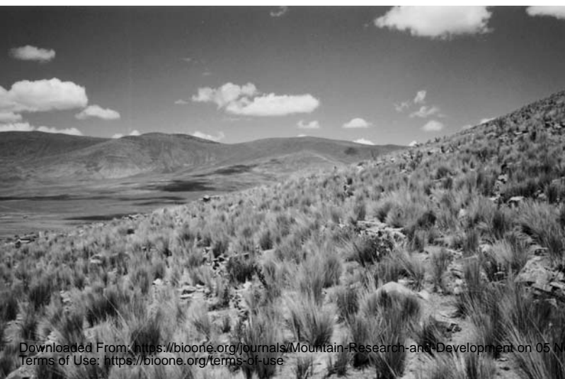
FIGURE 2 Vestiges of prehistoric terraces near Chorcoya, Tarija altiplano. These remnants indicate that the climate was once more favorable to cultivation in this dry area.

months of October–April. There are long periods of the year with very little rainfall, during which plants and livestock are under considerable stress. During the wet season, rainfall is not evenly distributed, characteristically falling during short, intensive storm events. This makes management of natural resources challenging and risky for the local population (Fairbairn 2000).