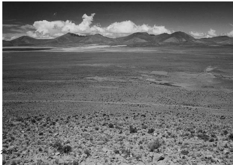
FIGURE 4 Tarija altiplano south of Chorcoya. This view shows walled fields, some of which are seasonally cultivated, extensive grazing areas, saline lagoons, and an accumulation of wind-blown sand in a small area of sand dunes.

Grazing pressure alone cannot therefore explain current differences in biomass. Sheep graze both the plateau and the mountain slopes and also graze pastures on the other side of the watershed. It is probable that the use of multiple zones has increased with time because livestock numbers have increased and alternatives to the more convenient plateau grazing were needed. The low biomass on the plateau may be influenced more by historical than by current grazing pressure.