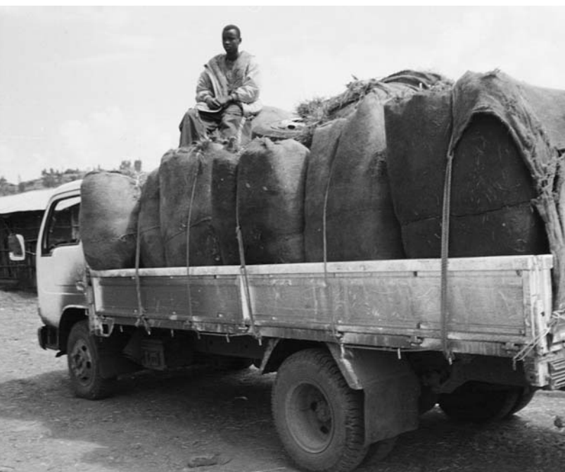
FIGURE 4 Khat is an important source of income not only for farmers but also for those engaged in its transport.

The expansion of khat production in Ethiopia should be closely observed because further khat expansion harbors considerable social and economic risks. First, there is a risk to the Ethiopian economy because