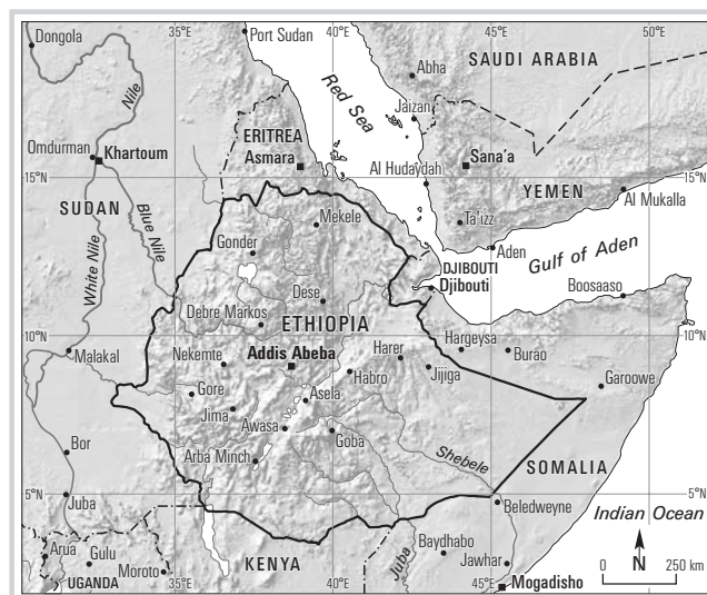
FIGURE 1 Map of Ethiopia. (Map by Andreas Brodbeck)

Khat ( Catha edulis ) is an evergreen tree grown for the production of leaves that are used as a stimulant. It can reach 25 m in height when grown naturally (Klinge 1998), but it is kept under manageable height when grown as a cash crop and for home consumption. The economically important products are its young leaves and tender twigs, which are chewed for their stimulating effect. Major areas of production and consumption are East Africa, southwest Arabia, and Madagascar (Pantelis et al 1989). Khat grows on well-drained soil under broad climatic conditions and tolerates drought for sev-