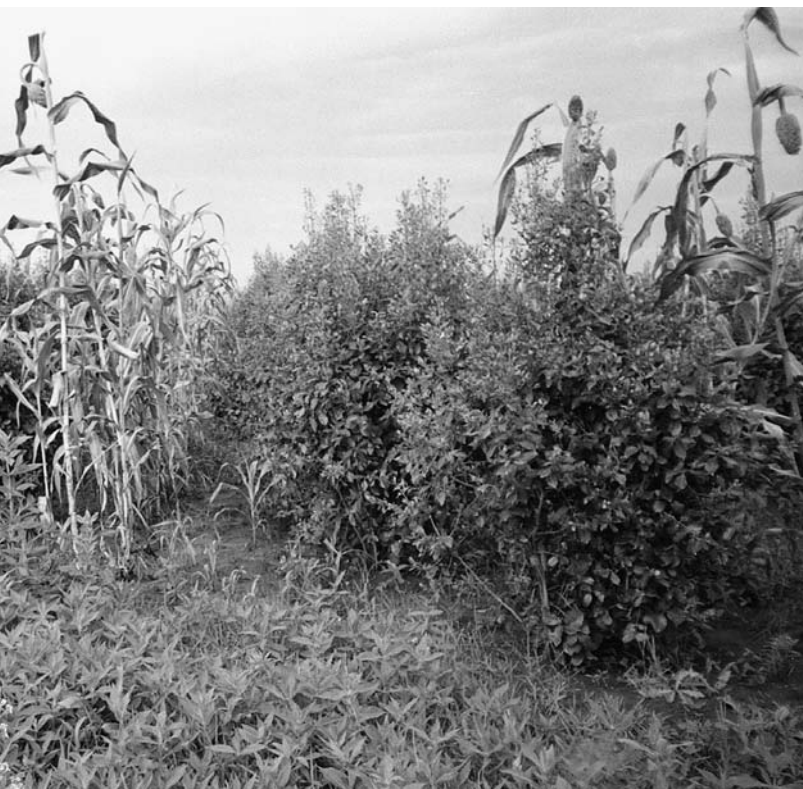
FIGURE 2 Intercropping of khat and sorghum.

the production is exported to Djibouti and Somalia, but the bulk of it is marketed and consumed within the country, mostly in the Somali administrative region (Green 1999). In 1998–1999, khat accounted for 13.4% of Ethiopia's export earnings and was the country's second largest export item that year (US Department of Commerce 2000). Although national data are lacking, the Ethiopian government collects huge revenues from the export taxation of khat. According to the west Hararghie finance office, export khat is taxed at 6 birr/kg, whereas khat consumed locally is taxed at 3 birr/kg. This level of export tax was also confirmed in a study by the US Embassy (2001). The price of khat fluctuates seasonally according to the quality and amount supplied. Khat exporters state that the farm gate price of export quality khat to Djibouti is 8–30 birr (US$0.97–3.62) per kg, whereas that supplied to Jijiga is 3–7 birr (US$0.36–0.85) per kg. The price of khat is higher in the dry periods than during the rainy season, from April to September, when the supply is abundant.