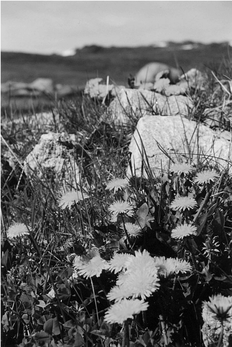
FIGURE 3 Dandelions ( Taraxacum officinale ) and clover ( Trifolium spp) growing along the edge of one of the gravel tracks near Mt Kosciuszko. Gravel track types often have a weed verge, whereas other track types, such as raised steel mesh walkways, do not provide weed habitat. Weeds are a problem in the alpine area; the diversity and abundance of weeds is likely to increase with predicted climate change.

water quality was feral animals, such as horses, pigs, foxes, cats, and in-stream trout introduced for recreational purposes. The impacts of feral fish on stream ecosystems are well recognized, with trout shown to reduce native fish populations within mountain creek systems in Australia (Cullen and Norris 1989; Green and Osborne 1994).