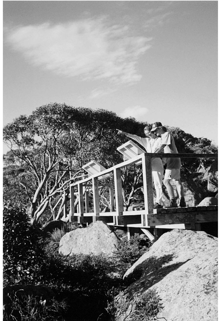
FIGURE 4 Sightseeing is the second most popular activity in the Kosciuszko alpine area. Lookouts such as this one at Charlotte's Pass provide visitors with interpretation and safety messages. This type of wooden structure protects the immediate environment from excessive trampling.

Norris 1999; Growcock 1999; AALC 2000; Buckley et al 2000). Changes in creek flow regimes as a result of snowmaking, snow grooming, and harvesting have been found, although most research is for mountain regions overseas (Good and Grenier 1994; Growcock 1999).